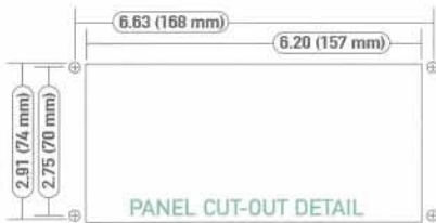
PANEL CUT-OUT DETAIL